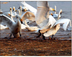
'Paradise' helps white swans survive the winter