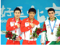
Diver He extends China's winning run at FINA Diving WC