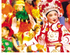
Compulsory Peking Opera course questioned